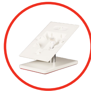
TEC-X-TM Table mount

Biamp and Apprimo are either trademarks or registered trademarks of Biamp Systems, LLC in the United States and other countries. Other product names referenced may be trademarks or registered marks of their respective owners and Biamp Systems is not affiliated with or sponsored by these companies.